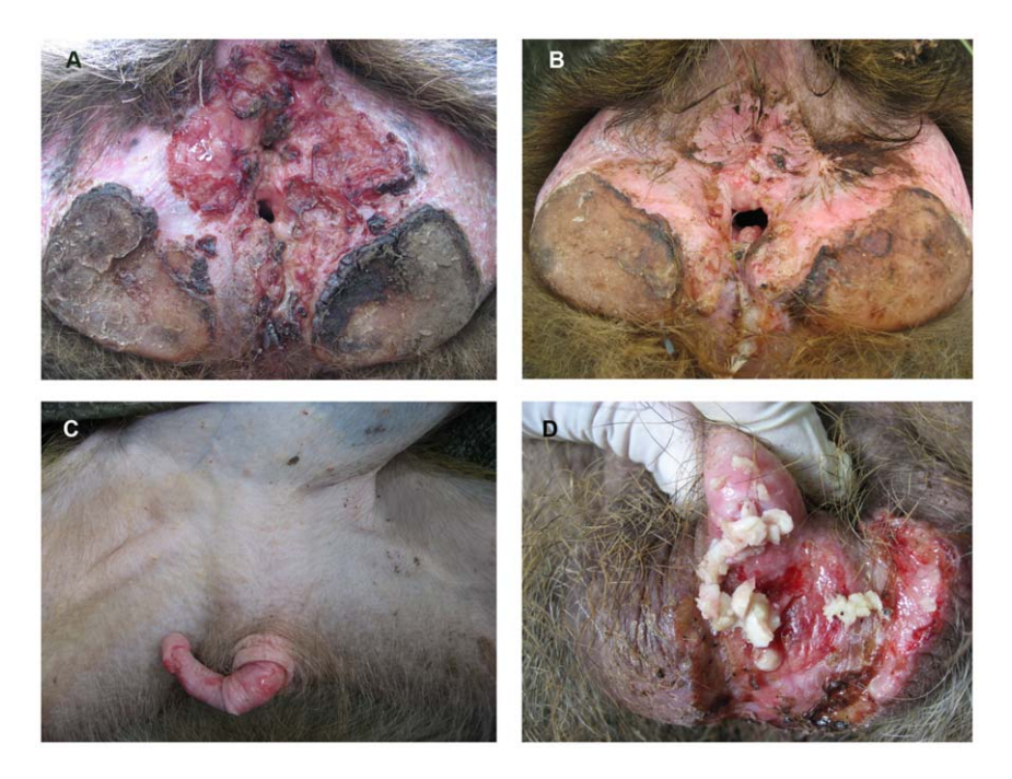
Figure 1. Gross pathology of olive baboons ( P. anubis ) with genital and circum-anal ulceration caused by T. pallidum at Lake Manyara National Park, Tanzania (2007). A. Adult female, severely affected, with massive destruction of the outer genitalia. The granulated tissue is fragile and bleeds easily on contact. The lesion is chronic and active. B. Adult female, severely affected, with massive destruction of the outer genitalia. The lesion is characterized by progressive scarification that has led to the vagina and anus being in a permanently open state. C. Sub-adult male, in an early stage of clinical infection. The corpus penis shows multiple erosions of the epidermis. D. Adult male with severe phimosis and genital ulceration. The prepuce is filled with smegma. The lesion is chronic and active.

Amboseli National Park, Mosiro, Lake Magadi, Gilgil, and Nanyuki) were examined using the very sensitive and specific T. pallidum particle agglutination test. Serological evidence of T. pallidum infection was found at only one of these sites, Nanyuki, where 57.5% of the animals tested positive for T. pallidum infection ( Table 1 ). Field notes and observations by researchers at Mikumi and all of the Kenyan sites, including Nanyuki, did not include any mention of signs of an anogenital disease.