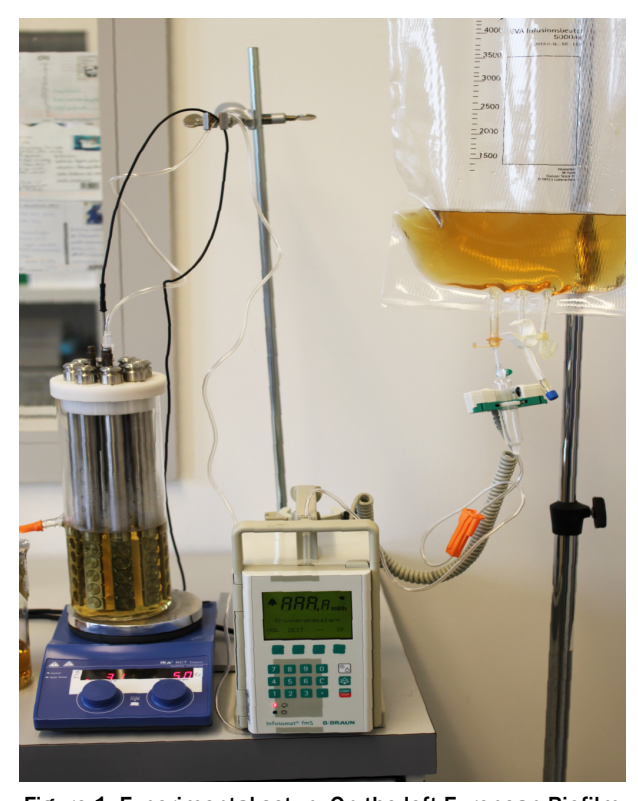
Figure 1: Experimental setup. On the left European Biofilm Reactor (EUREBI) with vertical placed titanium discs, on the right infusion bag as storage vessel for liquid culture, in the middle Infusomat to control the flow of liquid culture.

100 ml of the 48 h liquid culture and 550 ml of fresh BHI were added to the biofilm reactor. Afterwards, 5 titanium discs (15 mm diameter, 1 mm thickness, Institut Straumann AG, Basel, Switzerland) were fixed in one reactor bar and placed in the reactor. The reactor was coated for 24 h. Flow of the liquid culture was started and controlled by Infusomat fmS (B. Braun AG, Melsungen, Germany) with 18.6 ml/h. The used medium was transferred out of the reactor system by the Infusomat. In addition the medium was mixed using a magnetic stirrer (IKA RCT basic, IKA®-Werke GmbH & Co. KG, Staufen, Germany) with a speed of 50 rpm and heated on a plate at 37 °C. For adjustment of temperature, a measuring sensor was inserted into the reactor (Figure 1). The number of colony forming units (CFU) were determined at 0 h, 24 h, 48 h