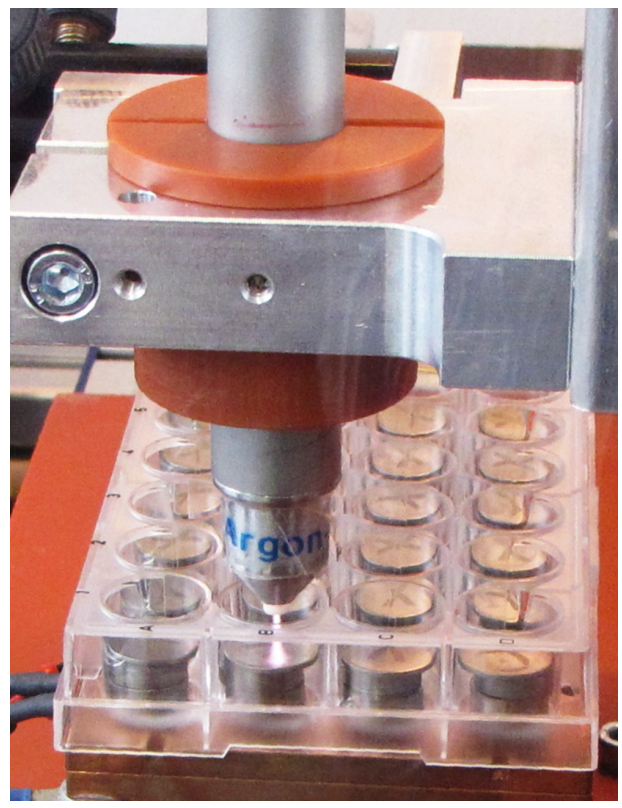
Figure 2: Experimental setup: Exposure of plasma jet kinpen09 (Neoplas GmbH, Greifswald, Germany) with argon as carrier gas on titanium plates in the 24 well plate

Gas flow was controlled by a flow controller (MKS Instruments, Munich, Germany). Titanium discs covered with the 72 h old biofilm of both models were transferred for plasma treatment into 24 well plates. The plasma source was attached to a computer-controlled x/y/z table and the 24 well plate was positioned below. Additional titanium discs were placed in each well under the exposed disc for storing the samples higher. Therefore the distance between the top disc and the plasma source was 10 mm. The kinpen09 moved meander-like in a diameter of 15 mm over each well (Figure 2). All six titanium discs were treated with plasma for a period of 30 s, 60 s, 90 s, 120 s and 180 s. Six samples were treated only with argon gas as "gas flow" control and 6 untreated samples served as negative control.