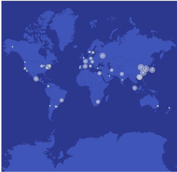
Fig. 2 Map of active MetaSUB sites. We have shown all the sites of the MetaSUB International Consortium that are collecting. The sizes of the circles are proportional to the number of riders per year on the subway or mass-transit system

samples collected and processed in each site. Finally, the kind of data will dictate the design of the visualizations. Such data include metadata taxa present (phylogenetic relationships and abundance), metabolic pathways, functional annotations, geospatial relationships, and time-lapse data. Finally, metadata outlined in Table 1 will also be integrated into the design of these visuals, since the metadata from a study can readily become the raw data for a follow-up study.