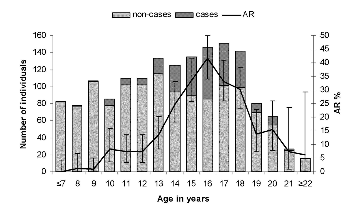
Figure 1: Number of cohort study participants and attack rate (AR) by age, Republic of Moldova, March 2008 (n=1,589).