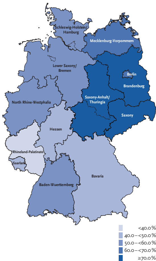
Figure 2 Vaccination coverage among people aged 60 and over in the 2007/2008 season, by state Data basis: GEDA 2009

al. 2005). More women tended to be vaccinated than men (59 % vs. 54 %) among the 60+ age group (cf. Böhmer et al. 2011).