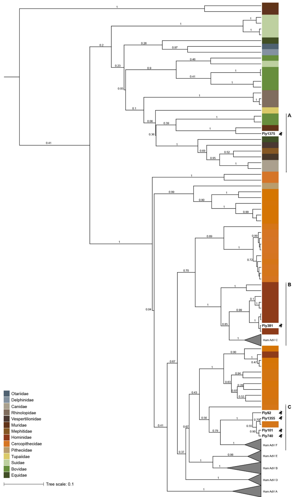
Figure 1. Maximum clade credibility (MCC) tree of mastadenoviruses. This MCC tree is based on the Bayesian analysis of a 370 bp long alignment of hexon gene sequences. Posterior probabilities are plotted above branches. The tree was built under a clock model and thus is rooted. Enlarged section A, B and C are shown in Fig. 2.