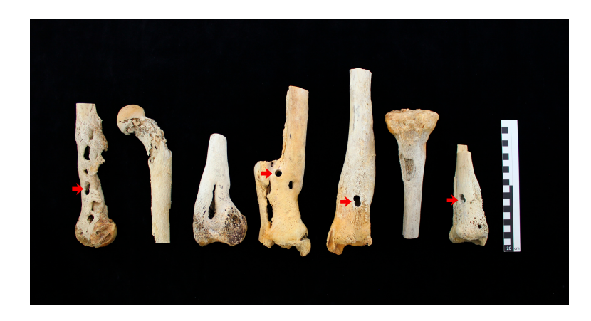
Figure 1. Bone specimens from seven different individuals with apparent signs of an osteomyelitis infestation. From left to right: 13:K:40:4 (femur, distal), 13:K:40:7 (femur, proximal), 13:K:40:9 (femur, distal), 13:K:42:3 (tibia and fibula, distal), 13:K:42:12 (tibia, distal), 13:K:42:14 (tibia, proximal), 13:K:43:1 (tibia, distal). Sampling sites: diaphysis all specimens, four specimens additionally close to the metaphysis (red arrows).

this study were permanently stored in the collections' magazine, and have thus not been handled intensively over the last decades. Each bone was sampled at the diaphysis and four of the specimens were sampled additionally at a position close to the metaphysis that revealed morphologically detectable signs of osteomyelitis (Figure 1 arrows). Hence, eleven samples were investigated to prove the presence of S. aureus DNA sequences. Unlike archaeological skeletal material, the bone specimens of the pathological collection have never been in contact with soil-inhabiting bacteria, which can colonize skeletal material [34]. Nevertheless, the PCR system should be designed in a way that it is applicable to archaeological material, which has usually been buried. To test the PCR system in the presence of DNA from soil-inhabiting bacteria as well as PCR inhibitors like humic acids, which are present in every type of soil [35], several spiking experiments were performed (Supplementary Text S1).