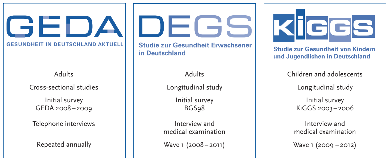
Figure 3: Components of health monitoring at the Robert Koch Institute

Official statistics are collected by the federal and state statistical offices to comply with legal provisions. The legal basis at the federal level is the Federal Statistics Act of 1987. The official data sources that are used for GBE include, for example, the microcensus, hospital statistics and cause-of-death statistics. 1% of the population are included every year in the microcensus to gather representative data on