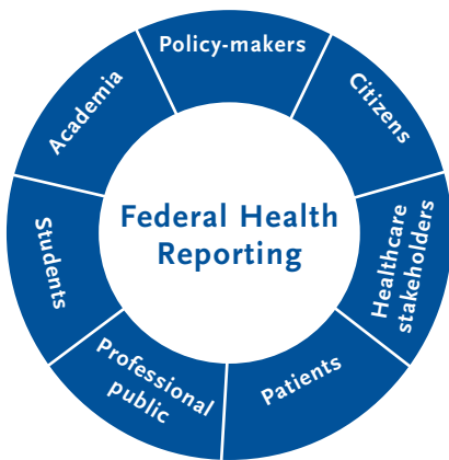
Figure 1 Target groups of Federal Health Reporting

Federal Health Reporting is carried out by the Robert Koch Institute (RKI) and the Federal Statistical Office, each focusing on different tasks in close consultation. RKI is responsible for the content, conceptual design and further development of reporting, as well as for compiling and publishing the health reports. Federal Statistical Office focuses on the collection, processing and provision of data and makes the “Information System of the Federal Health Monitoring (IS-GBE)” available to the public as an online database ( www.gbe-bund.de ). Federal Ministry of Health is politically responsible for GBE. Scientific experts, the players in the healthcare sector, and the federal states are consulted via the Health Reporting and Health Monitoring commission, whose currently 16 members have an advisory function. Conversely, GBE representatives collaborate with numerous political and scientific working groups and committees at the national and international level, thus ensuring a constant exchange of information with policy-makers, researchers and practitioners.