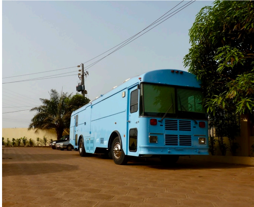
Fig 1. The Plasma mobile.

https://doi.org/10.1371/journal.pntd.0006885.g001