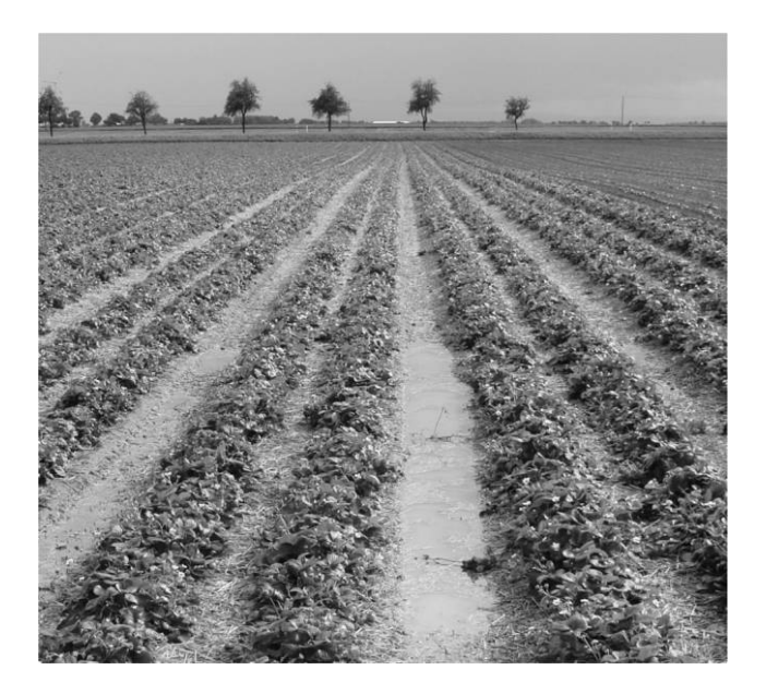
Figure 2. Strawberry field located near the outbreak field, shown after heavy precipitation in September 2007. The same conditions were present during the outbreak period.

on the outbreak field, which had been ploughed at the time of the site visit.